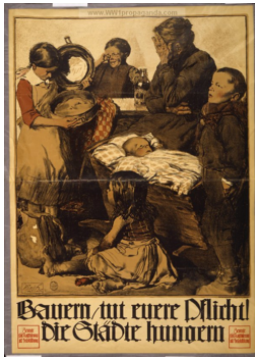
“Farmers, do your duty! The cities are starving”