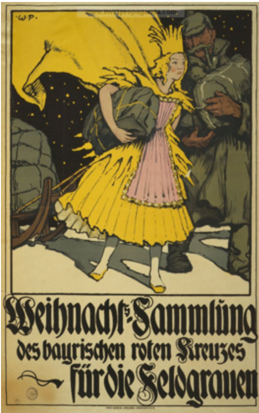
“Christmas collection by the Bavarian Red Cross for the armed forces.”