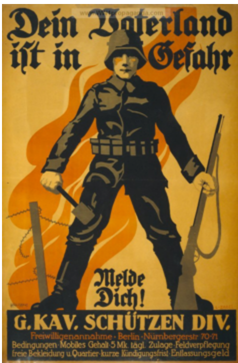
“Your Fatherland is in danger. Register!”