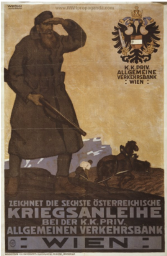
“Subscribe to the 6 th Austrian War Loan”