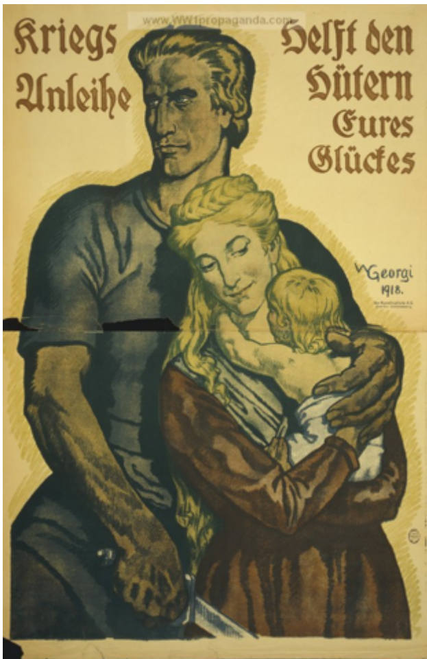
“War loans help the guardians of your happiness”