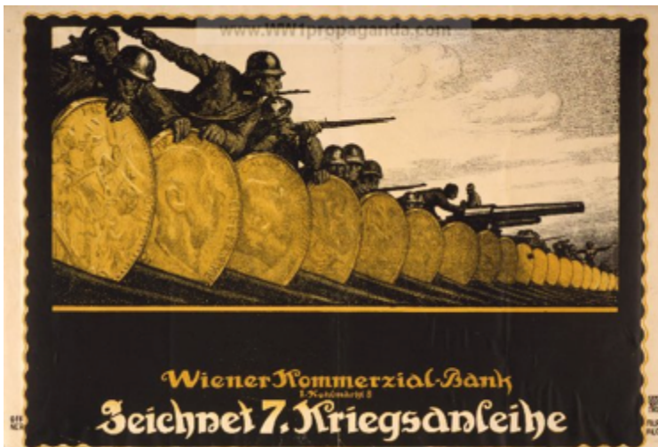
“Subscribe to the 7 th War Loan. Vienna Commercial Bank.”