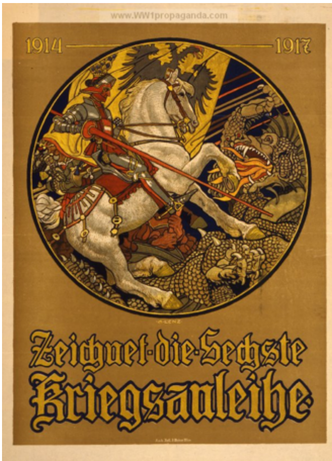
“Subscribe to the 6 th War Loan”