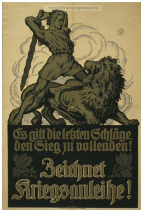
“It is essential that the last blows achieve victory! Subscribe to the war loan.”