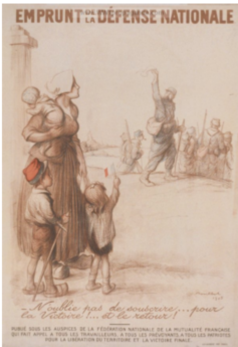
“National Defense Loan”