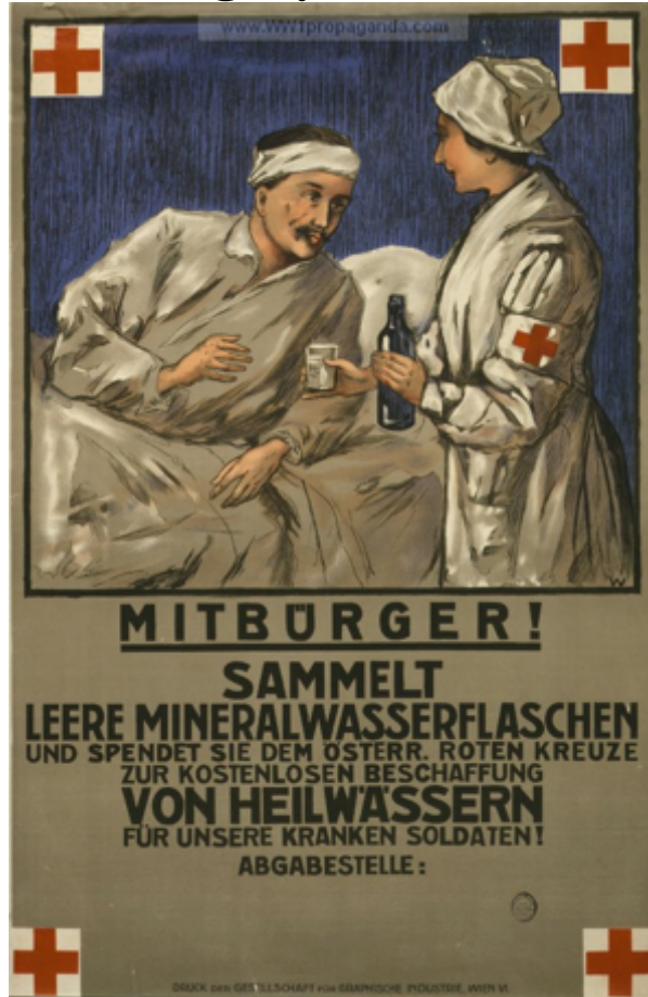
Text asks people to collect empty mineral water bottles and donate them to the Red Cross.