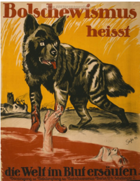
“Bolshevism means the world will drown in blood. Association to Fight Against Bolshevism.”