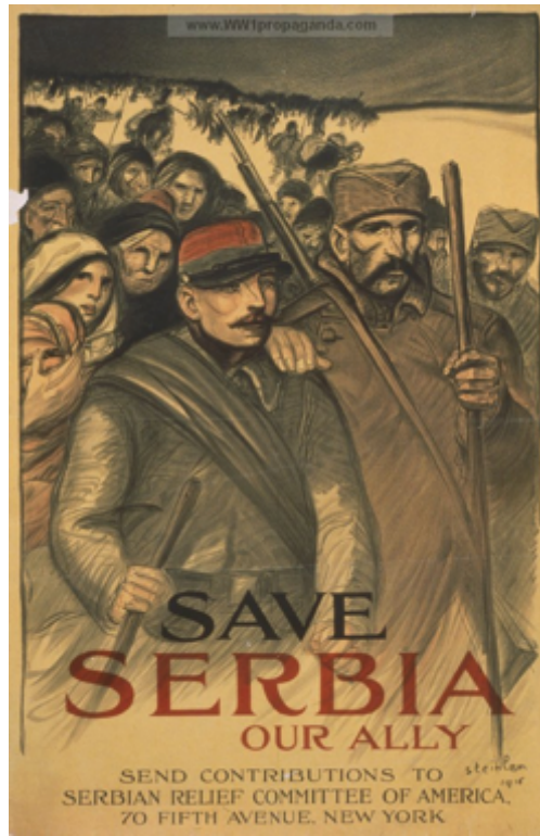
Published in Paris, France.