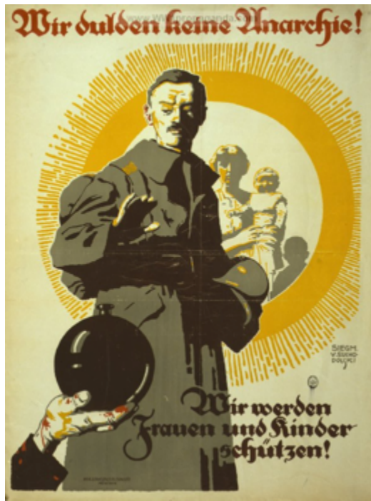
“We won’t tolerate anarchy! We’ll protect women and children.”